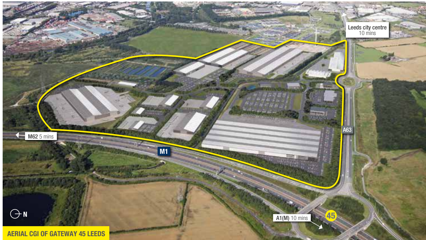
AERIAL CGI OF GATEWAY 45 LEEDS

The site also benefits from Central Government Enterprise Zone status, offering a range of incentives to occupiers.